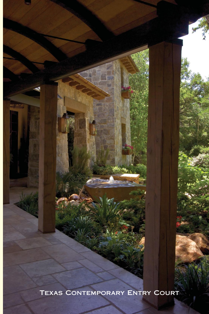
TEXAS CONTEMPORARY ENTRY COURT

To protect their dream, most clients request additional detail drawings of the interior elements that are particularly important to the character of their home.