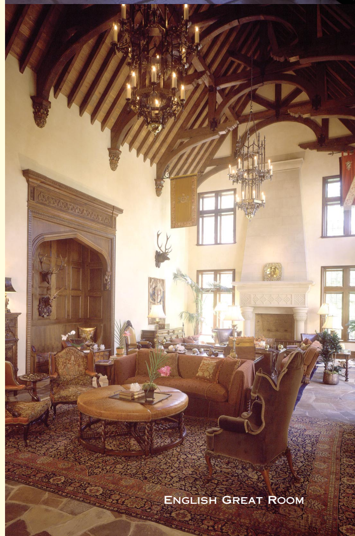
ENGLISH GREAT ROOM