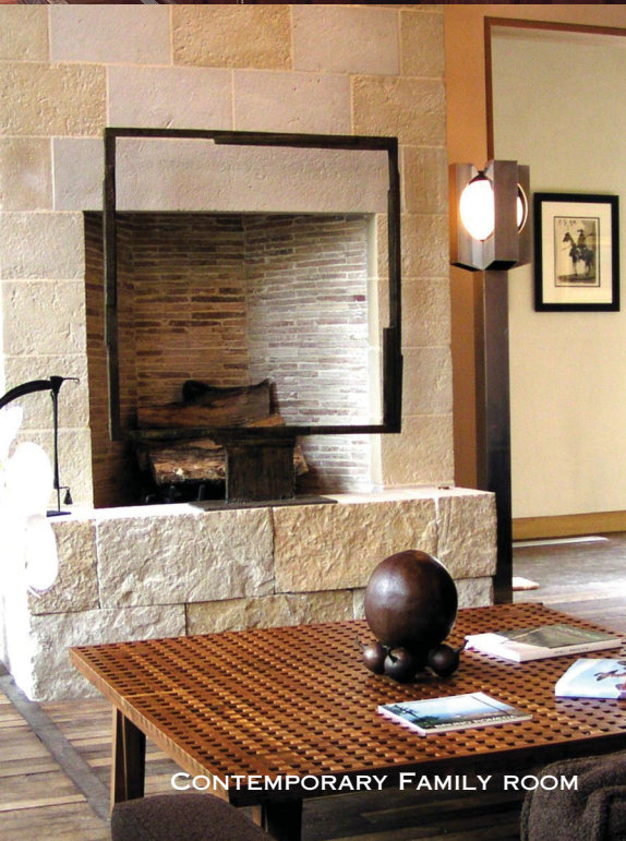
CONTEMPORARY FAMILY ROOM