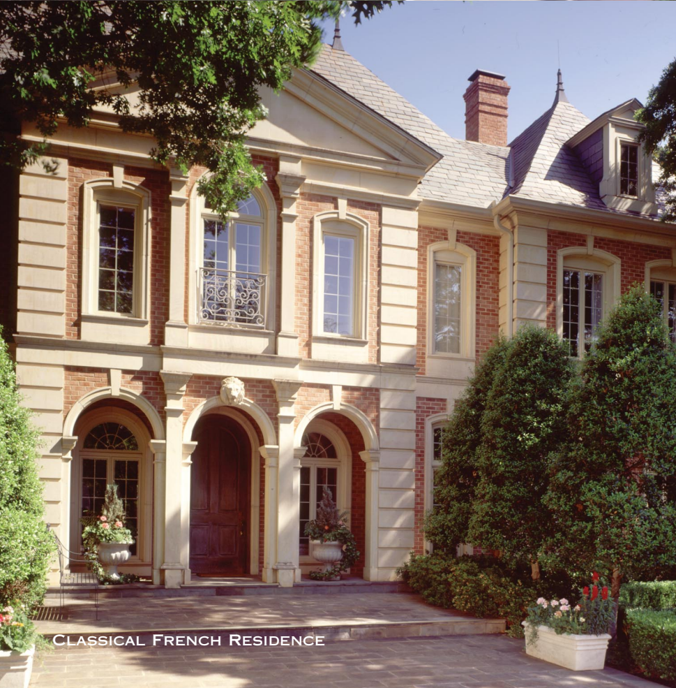
CLASSICAL FRENCH RESIDENCE