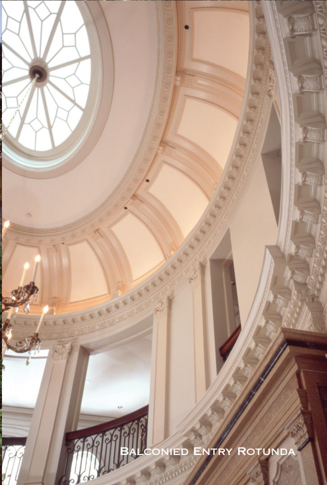
BALCONIED ENTRY ROTUNDA