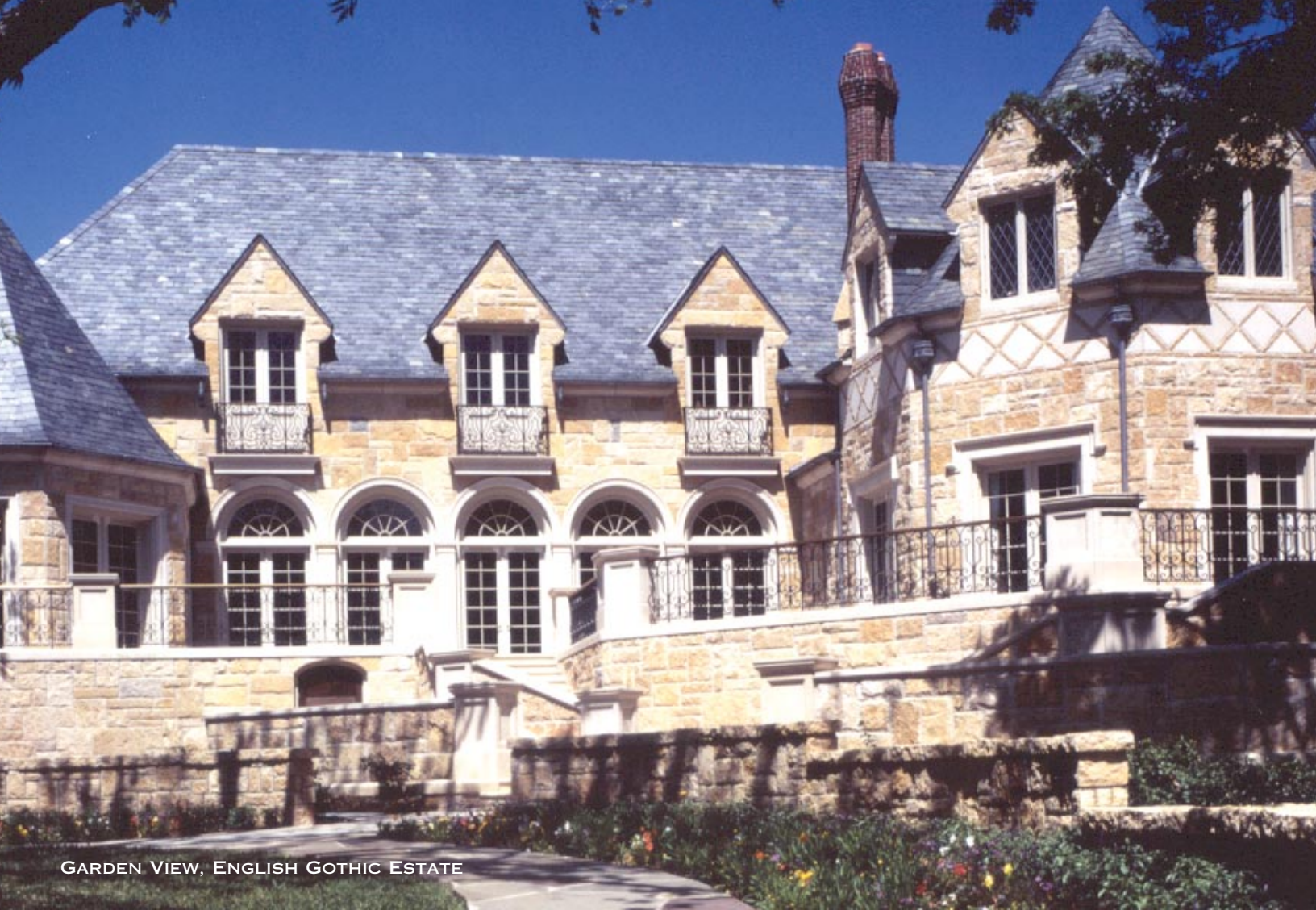
GARDEN VIEW, ENGLISH GOTHIC ESTATE