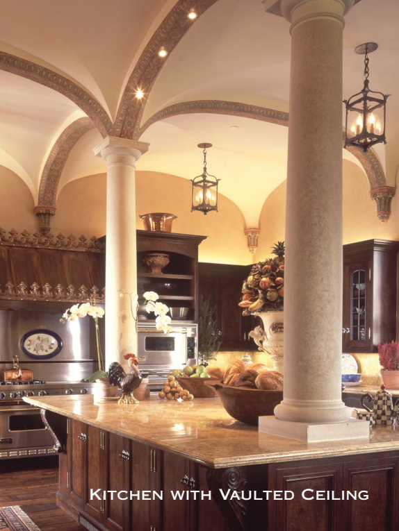
KITCHEN WITH VAULTED CEILING